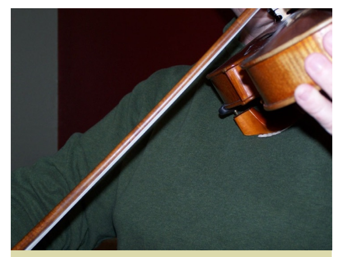
I am bending the bow until the horse hair touches the wood. Important: Make sure to use a correct bow hold. If you ball up your fist during this exercise you could damage your bow.

Remember, according to the rest of the world, the keys to tone production and tone color are 1) Bow Weight, 2) Bow Speed, and 3) Bow Placement, or sounding point. But BEFORE any of those 3 keys can do anything for you, you must master the skills of pulling a straight bow and using a greasy elbow.